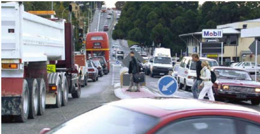
Traffic congestion within the Queenstown central business district.

A high-quality, high-frequency bus service, park-and-ride facilities and ferries are just some of the innovative approaches underpinning a strategy to tackle transportation issues facing our premier holiday destination, Queenstown.